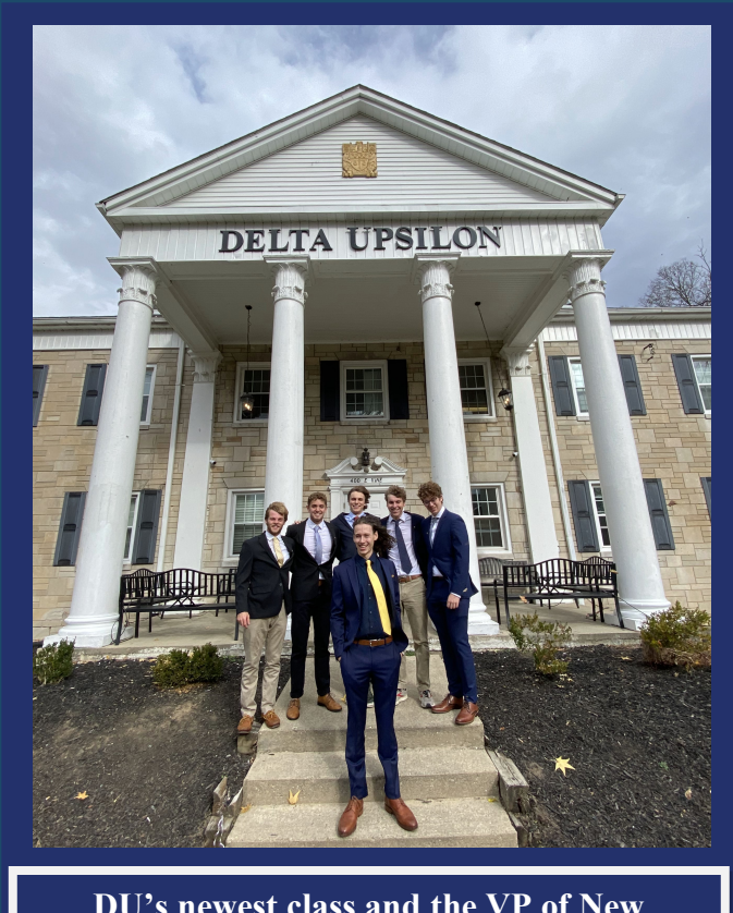
DU's newest class and the VP of New Member Education, shortly after initiation.